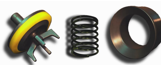
Premium wing guided valve, spring, & full open seat

AVAILABLE IN API-6 AND API-7 SERIES FOR MOST ALL POPULAR MUD PUMP APPLICATIONS.